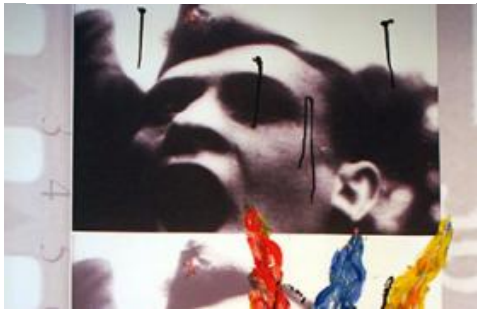
MOSCOW MUSEUM OF MODERN ART

The celebrations on May 9, the day on which all Russians celebrate the memory of the Soviet victory over Nazi Germany, have grown increasingly brash and pompous in recent years. Seeking ways to bolster its patriotic agenda, the Kremlin has co-opted Victory Day, mythologizing it by airbrushing out inconvenient facts and turning it into a shiny celebration of national unity.